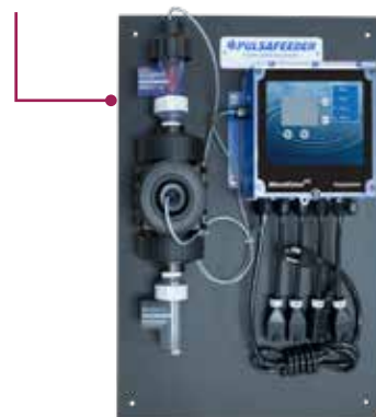
STANDARD PANEL AND FLOW ASSEMBLY