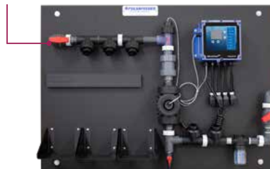
PANEL-MOUNTED WITH PUMPS